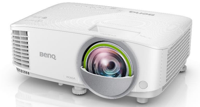
296 (W) x 120 (H) x 250 (D) mm

Introducing EW805ST, an Android-based smart projector designed specifically for education. This all-in-one short throw smart projector comes pre-loaded with EZWrite 6 software that allows for an interactive whiteboard. Teachers and students can open apps directly on the BenQ EW805ST, easily accessing online resources from in the classroom.